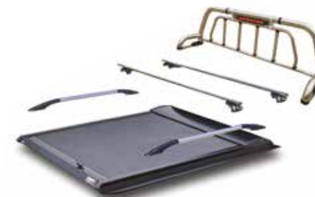
Without limits. Easy installation – No drill