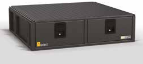
Sizes vary from vehicle. E.g. Land Rover discovery dimensions