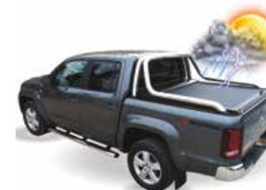
Perfect protection from weather conditions